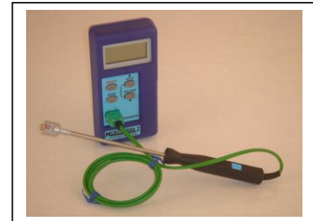
Thermometer and s/s band surface probe to check jaw temperatures.